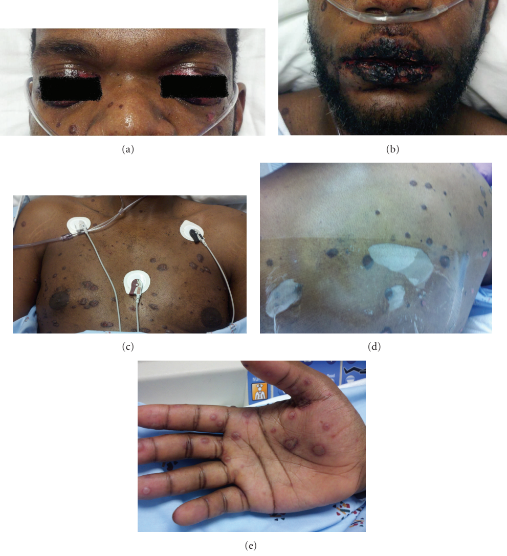
FIGURE 1: (a) Swelling and necrosis of eyelids with conjunctival erythema. (b) Severe necrosis of oral mucosa. (c) Macules and patches on chest. (d) Rash on back with areas of necrosis and denudation. (e) Targetoid lesions on right palm.