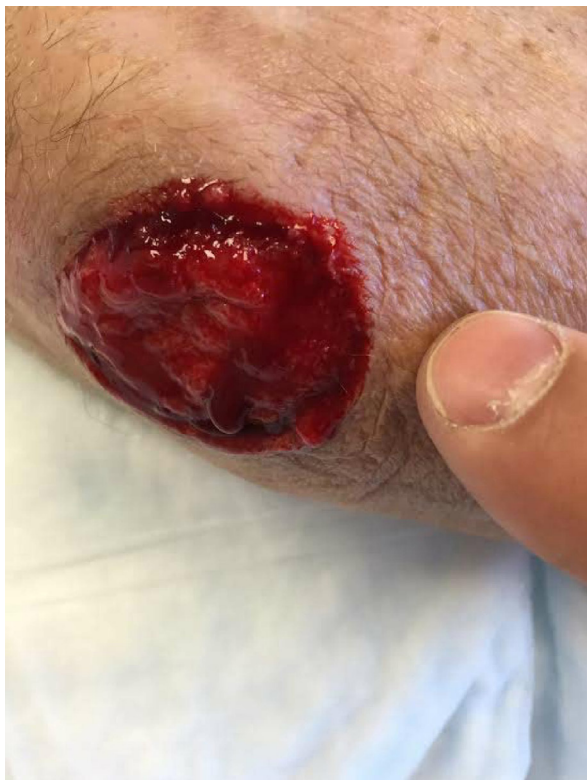
Figure 1 Photograph of the patient's left elbow. The open wound exposes the olecranon bursa region, but the bone was never exposed during the entire course of treatment.

been started by the surgeon. This treatment was continued for 2 weeks. No additional cultures were obtained. Because of continuing drainage and the lack of the expected robust erythematous granulation tissue, ertapenem (1 g once daily) was then added and this two antibiotic treatment was continued for an additional 2 weeks. However, the clinical response to this double antibiotic treatment continued to be poor. Because of this an infectious disease specialist (MRO) was consulted. The consultant stopped ertapenem and started piperacillin/tazobactam 4.5 g intravenously every 8 hours. This change was based on data showing that this penicillin-based antibiotic with a beta-lactamase inhibitor would provide coverage for P. acnes in addition to: (1) continuing broad-spectrum coverage primarily for the possibility that another pathogen (in addition to S. epidermidis ) was present but did not grow in subsequent cultures and (2) more aggressively treating the olecranon osteomyelitis. 4,5