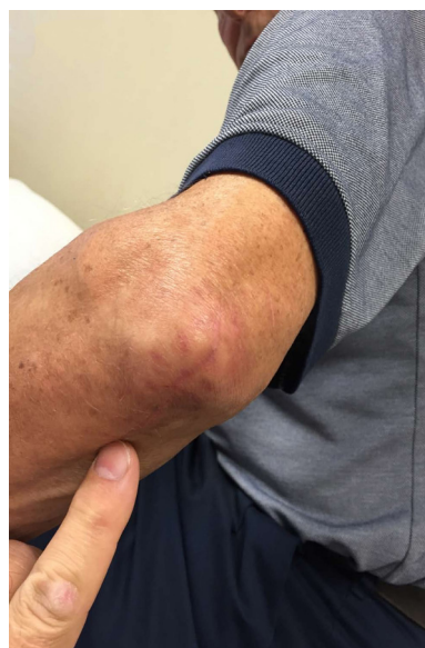
Figure 3 Photograph taken 4 months after the elbow wound was closed. The wound had healed well and without any problems at final follow-up, which was 14 months after this photograph was taken.

To our knowledge this is the first reported case of infected olecranon bursitis with the causal organisms being S. epidermidis