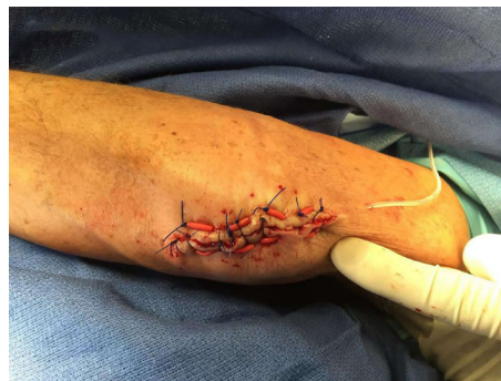
Figure 2 Photograph of the patient's left elbow showing the lesion closed with retention stitches. The stitches are passed through 0.5 cm segments that were cut from a narrow rubber tube, which are bolsters that serve to distribute stress so that the stitches do not cut through the skin.

After piperacillin/tazobactam was started, the wound started to granulate well and was closed after 18 days of treatment with this antibiotic. Closure included a Z-plasty and retention stitches with bolsters which enabled closure of the retracted skin margins