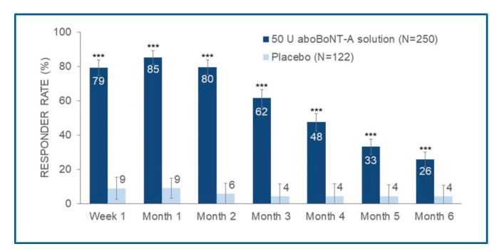
Figure 3. Subject satisfaction responder rates over time (mITT population). Responders were "satisfied" or "very satisfied" with the appearance of their glabellar lines post-baseline and "dissatisfied" or "very dissatisfied" at baseline. Error bars show 95% confidence intervals. The difference between aboBoNT-A solution and placebo was statistically significant at all time points, p < .0001.

An overview of treatment-emergent adverse events (TEAEs) and the frequencies of the most common TEAEs judged as treatment-related from the pooled data analysis are summarized in Supplemental Digital Content 8 , adverse events (See Table S4, http://links.lww.com/DSS/B155). In total, 17% of subjects in the aboBoNT-A solution group had TEAEs judged as treatment-related, versus 6% in the placebo group. The treatment-related TEAEs reported by >1% of subjects in the aboBoNT-A solution group were headache (6.4% vs 2.4% for placebo), injection-site pain