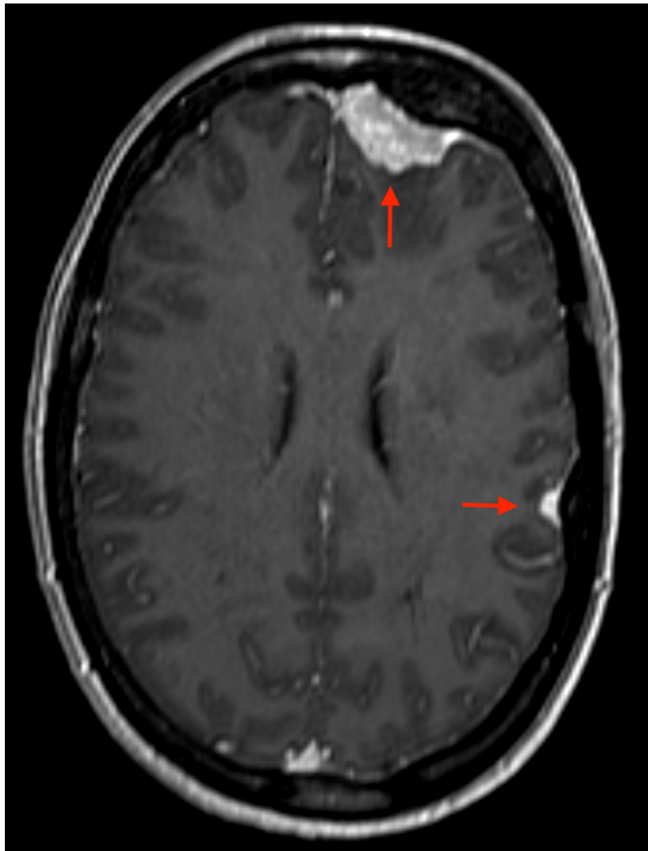
FIGURE 2: Axial T1-weighted MRI-contrast scan showing left frontal, and temporal meningiomata.