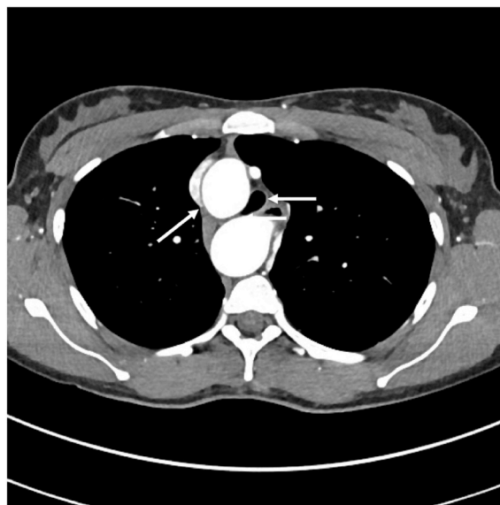
Fig. 2. CT thorax with contrast demonstrating tracheal compression by vascular structures (short arrow indicating tracheal lumen; long arrow indicating right sided aortic arch at level T4; axial view).

Following multidisciplinary team discussion and surgical risk review, the patient opted for a surgical approach to treatment. This entailed dissecting the vascular ring, aortic arch reconstruction and transposition of the left subclavian artery to the left carotid artery. Previous studies have described successful outcomes and symptomatic improvement in 97% of patients following surgery [10]. Despite initially