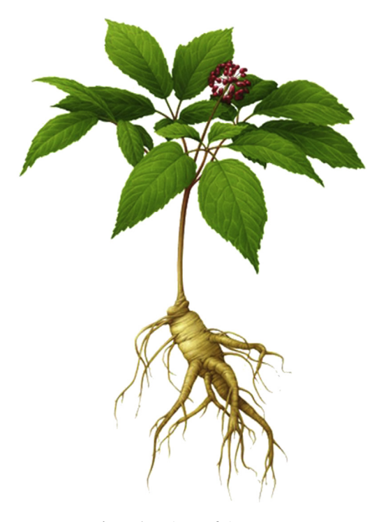
Fig. 1. Plant picture of ginseng.