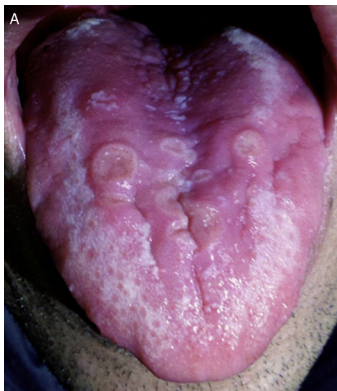
Fig. 1 – Asymptomatic ulcerated lesions in the tongue.

A 35-year-old man presented with a 3-week history of asymptomatic ulcerated lesions in the tongue (Fig. 1). He developed erythematous papules in the trunk and legs at the same time. The patient had no other systemic symptoms and reported having had unprotected sexual intercourse. Testing for the human immunodeficiency virus was positive. VDRL testing was positive with a titer of at least 1:64. A tongue biopsy revealed an inflammatory infiltrate suggestive of secondary syphilis with positive immunohistochemistry for Treponema pallidum (Fig. 2). The patient was treated with intramuscular benzathine penicillin for two weeks. The lesions completely resolved during a 4-week period. Syphilis is well known for