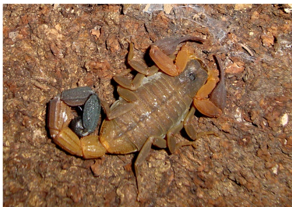
Figure 1 Adult female of Rhopalurus amazonicus .

A 32-year-old healthy male weighting 72 kg was stung by a scorpion on his right thumb while collecting these animals (Figure 2). The accident occurred in a savanna in the Tapari community, Santarém city, Pará state, Brazil