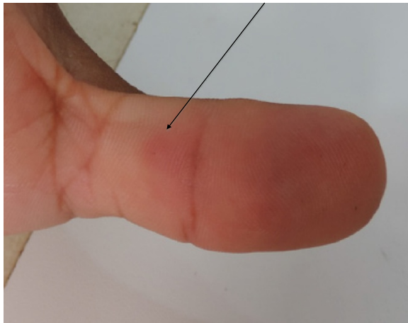
Figure 2 Scorpion sting site on the middle of the thumb 56 hours after the accident.

the Amazon forest in Pará state, which, based on the symptoms, was classified as mild or Class I. However, it is known that symptoms provoked by envenomations depend on several factors such as the dose of venom injected, site of the sting, age, body mass and physiological conditions of the victim, being children and elderly the most vulnerable [5,6,9,16,17]. In conclusion, this report contributes to the knowledge on scorpion species capable of causing envenomations in Brazil. However, further study is required in order to evaluate the toxicity of this species on humans, which will make possible the classification of R. amazonicus as a scorpion of medical importance in the country.