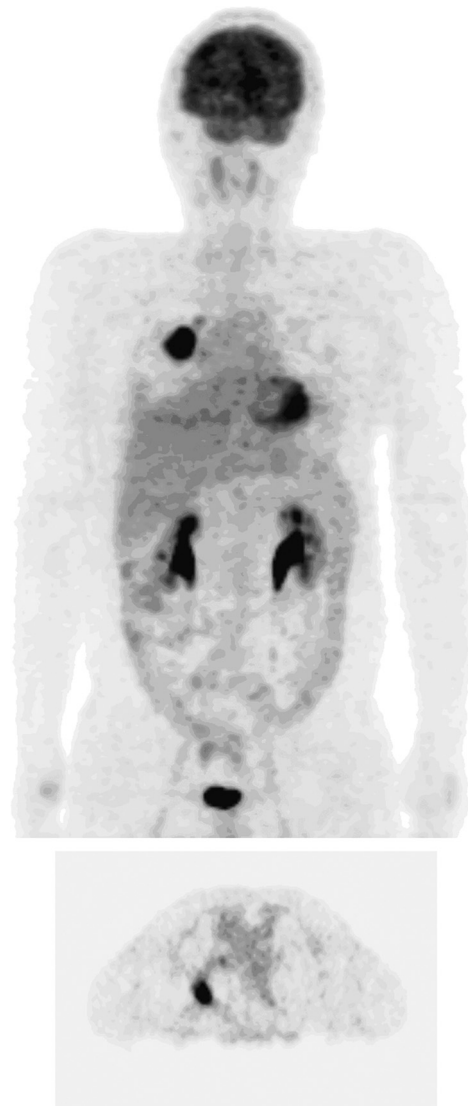
Figure 2 An 18F-fluorodeoxyglucose (FDG) positron electron tomography (PET) scan showing lesions with obviously increased standardized uptake values (SUVs) in the lower lobe and hilum of the right lung.

A multidisciplinary discussion of our patient's case was carried out. Primary lung carcinoma was considered to be the most likely diagnosis. Our patient refused to undergo a CT-guided needle biopsy and asked for exploratory thoracotomy instead. Considering our patient's wishes, a right exploratory thoracotomy and right upper lobectomy was performed under general anesthesia. Pathological examination of samples showed lung cryptococcal granuloma, with positive staining with periodic acid Schiff (PAS) and periodic acid-silver methemamine (PASM). No acid-fast bacilli were found. All the lymph nodes including six of the bronchial lymph nodes, two of group 2, two of group 3, five of group 4, five of group 7 and one of group 8 showed chronic inflammation (Figure 3). Our patient was treated with fluconazole tablets post-operatively (0.2g once