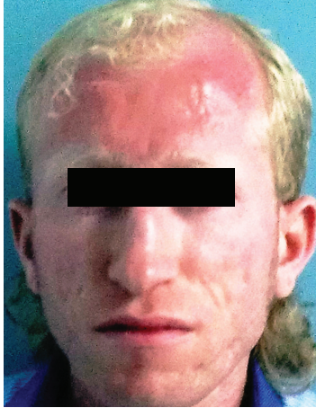
FIGURE 1: Patient exhibiting oculocutaneous albinism and exotropia.