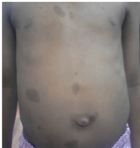
Fig. 2. Multiple café au lait spots were present on back and abdomen.

and abdomen (Fig. 2). There was no history of similar complaints in any family member or distant relatives. Lid reconstruction with lateral canthopexy was done along with forehead tumor debulking (Fig. 3). After surgical removal of the mass, the tissue was sent for histopathological evaluation. On gross examination, mass comprised of 3 soft tissue pieces (Fig. 4). Out of three, two pieces were partly skin covered measuring 6 \times 2.5 \times 1 cm and 2 \times 1 \times 0.5 cm respectively. Amongst