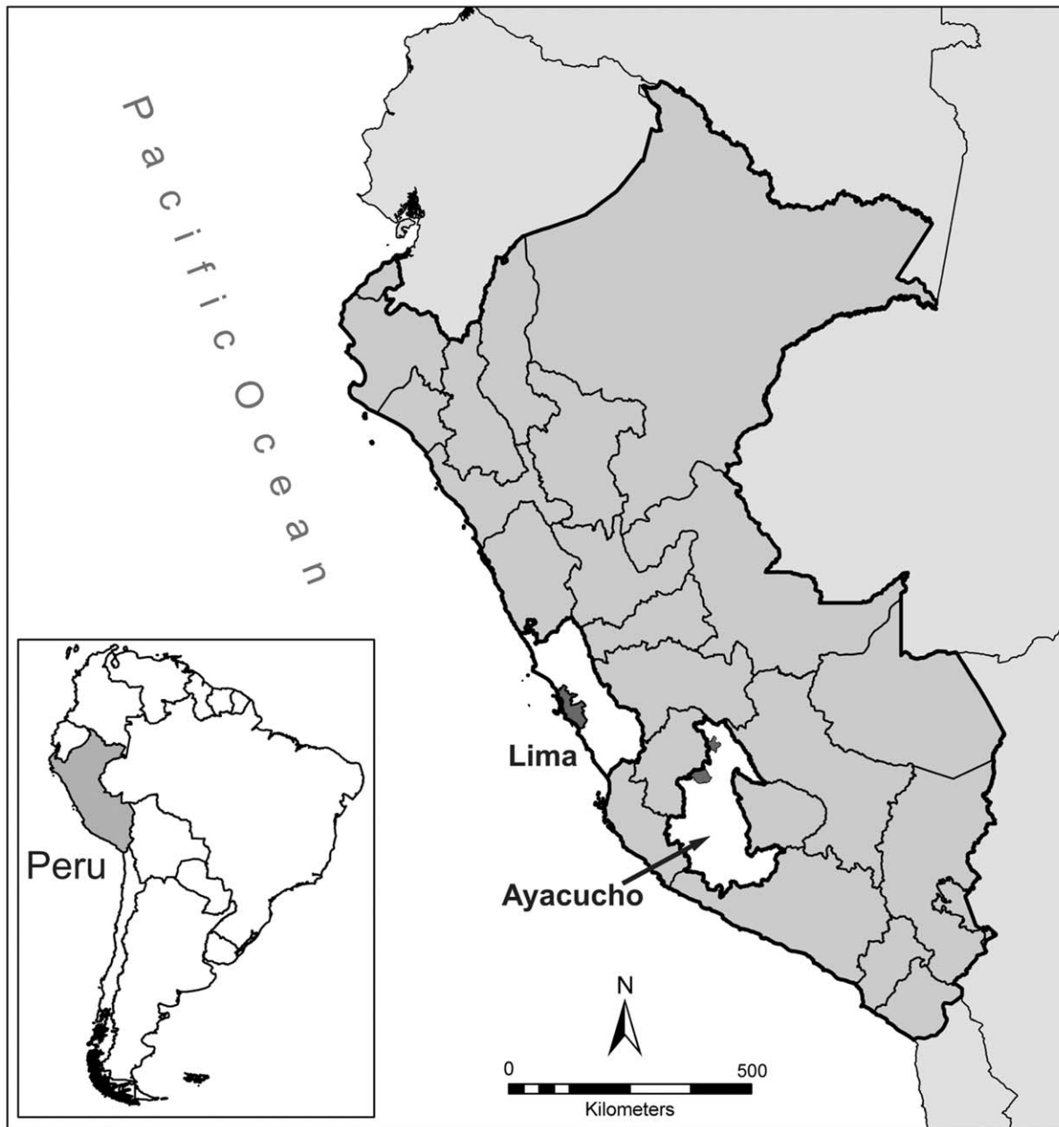
Figure 1. Map of Peru showing location of study sites. Lima and Ayacucho Regions illustrated in white. Dark grey areas illustrate Lima metropolitan area and Districts of Vinchos (south) and Santillana (north) in Ayacucho. doi:10.1371/journal.pone.0051795.g001

scores are widely used in paediatric research in order to adjust data for age effects so that characteristics can be compared across a range of ages. They represent the position of an individual within the frequency distribution for a given age in terms of standard deviations from the mean. The use of z scores therefore takes into account variation in body proportions at different ages, as well as differences in the variability of different anthropometric dimensions. All ANCOVA were performed on these z scores.