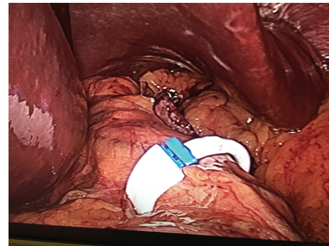
FIGURE 2: Laparoscopic Sleeve Gastrectomy with GaBP Ring Autolock™ System.

All procedures performed in studies involving human participants were in accordance with the ethical standards of the institutional and/or national research committee and with the 1964 Helsinki declaration and its later amendments or comparable ethical standards. The study was approved by the local ethics committee.