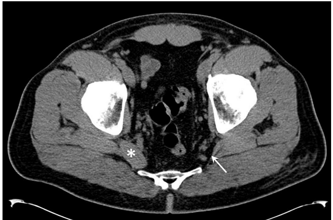
FIGURE 1: Computed tomography evaluation of the piriformis muscle.

Axial computed tomography slice at the pelvic floor level shows absence of piriformis muscle (arrow). The right piriformis muscle is unremarkable (asterisk).