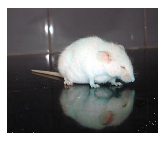
Fig. 1: Experimentally infected mice showing dullness, closed eyes, timid behavior, raised hair coat and pendulous abdomen (Original)

While the uninfected mice remained healthy and did not show any of these abnormal signs and remained fully alert and active throughout the experiment. None of the uninfected mice died during the study period.