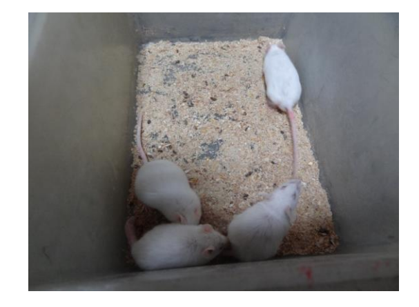
Fig. 2: Experimentally infected mice clubbed together at the periphery of cage showing altered behavior (Original)