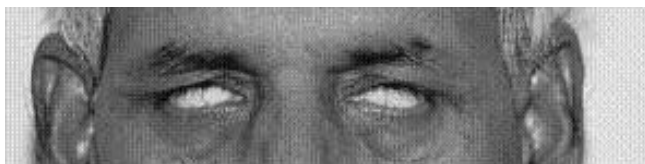
Figure 1 Patient at time of presentation, photograph showing bilateral lower motor neuron type of facial palsy and presence of Bell's phenomenon.