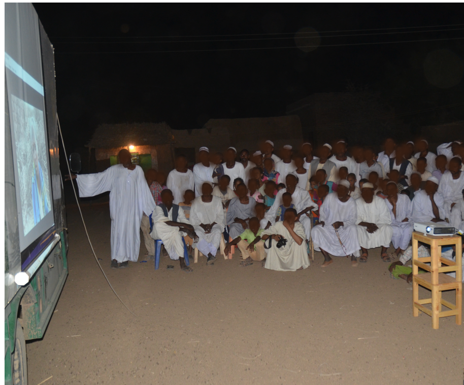
Fig 5. The villagers attending health education session, watching video films on mycetoma awareness.

“Mesaket Story”, a drama film documented a mycetoma patient journey from minor infection which was neglected till limb amputation was produced and was shown to more than 2000 individuals at WOMRC and other villages.