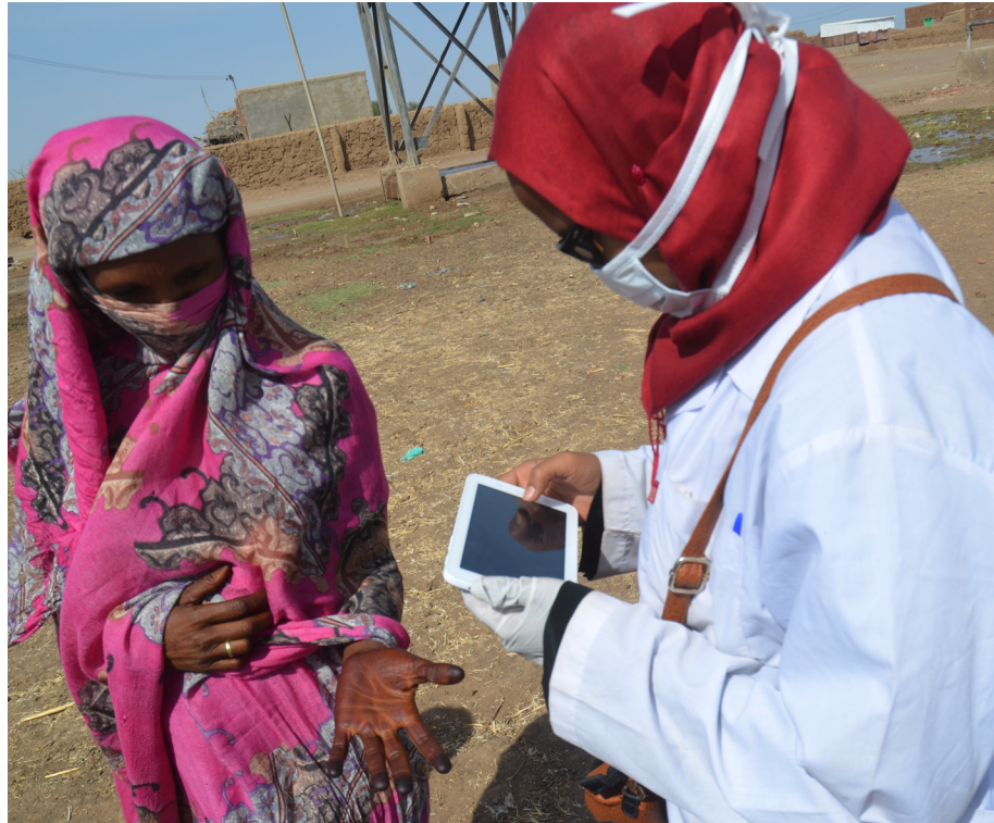
Fig 1. Photograph showing a surveyor using a computer tablet with the CAPI programme to collect information on a suspected patient.

https://doi.org/10.1371/journal.pntd.0006391.g001