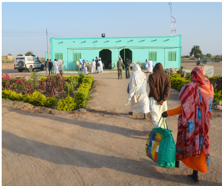
Fig 2. Photograph showing Wad Onsa regional mycetoma centre at East Sennar Governate.

https://doi.org/10.1371/journal.pntd.0006391.g002