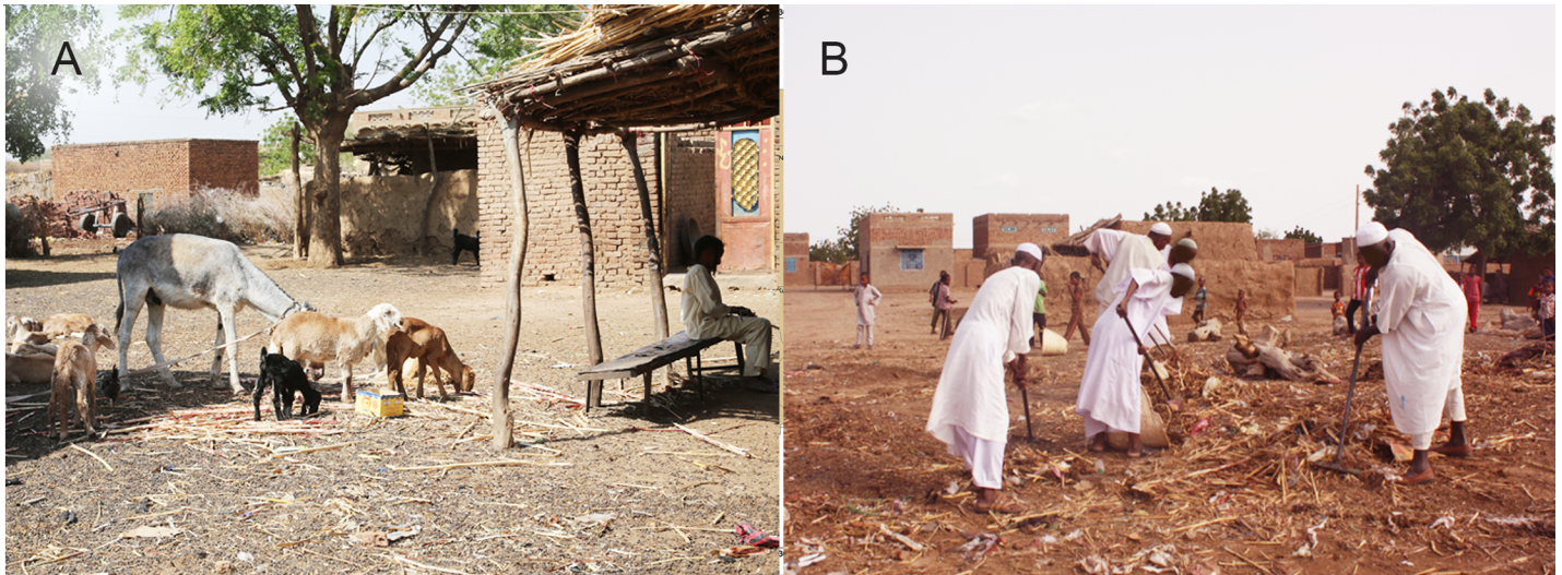
Fig 4. (A) Photograph showing the poor community environment, animals in proximity with the villagers within the houses, animals' dungs and dirt. (B) The villagers removing the thorny animals' enclosures, dirt, animals' dungs and burring them to improve the local environment and hygiene.

https://doi.org/10.1371/journal.pntd.0006391.g004