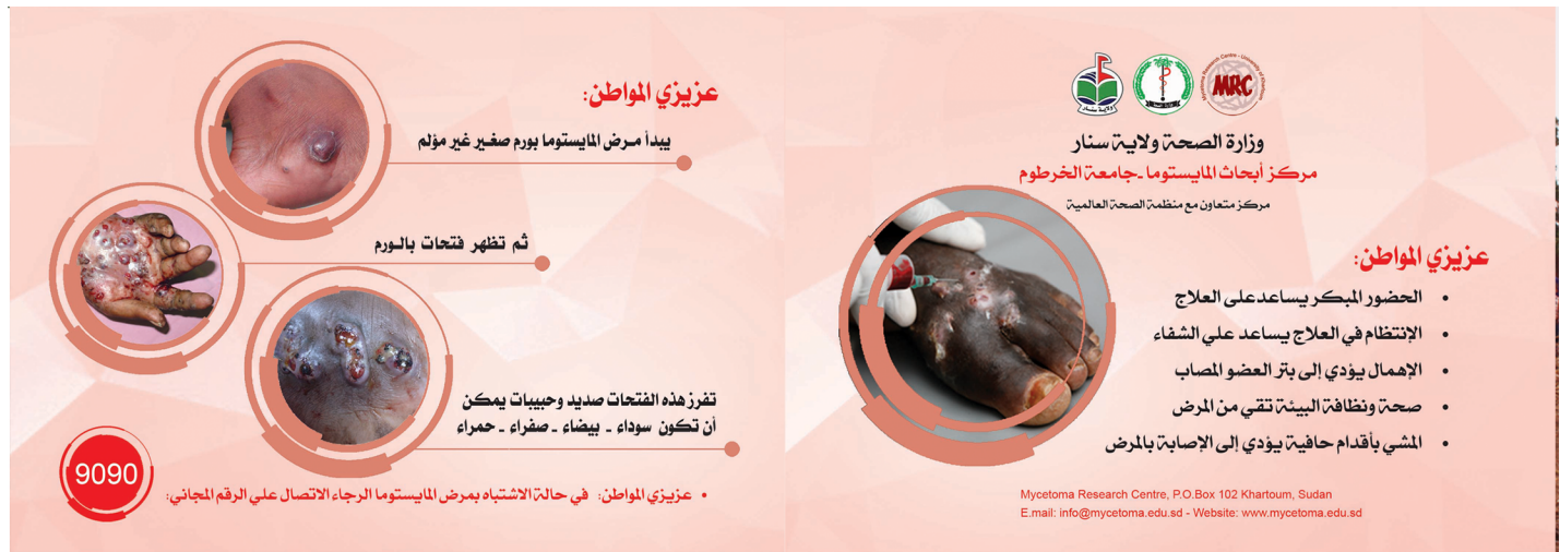
Fig 3. Suspected patients' referral card.

https://doi.org/10.1371/journal.pntd.0006391.g003