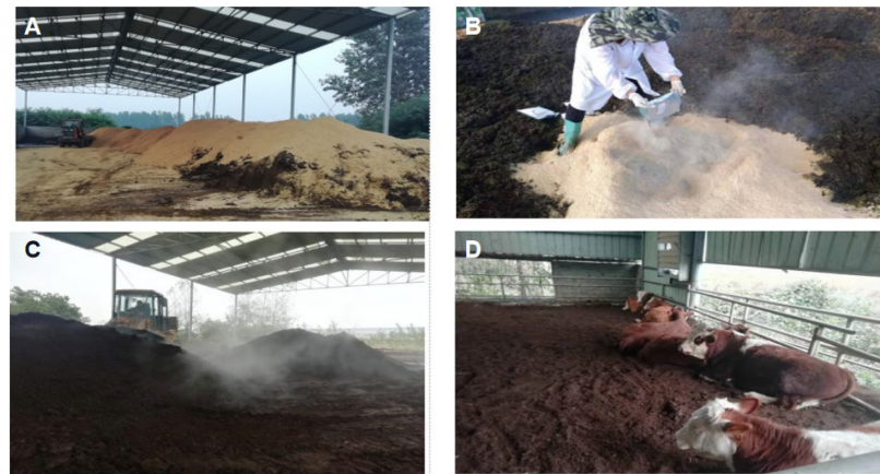
Figure 1. The production process of harmless fermentation bedding material of bovine manure. The manufacturing process of cow manure into bedding through a harmless fermentation treatment. (A) Collect fresh cow dung. (B) Addition of microbial species followed by even turning over of the pile. (C) Turning the pile regularly. (D) Bedding material distributed in the barn.

The temperature of the pile was detected with a handheld digital display thermometer every day. When the temperature of the pile reached 55 °C, the pile was stirred with a forklift every 5 days. The bovine manure underwent the heating period, high-temperature period, cooling period, and finally, the pile temperature fell to room temperature, indicating the completion of harmless ectopic fermentation. The fermented bovine manure was bedded to the cattle pen with a forklift. the CF group was bedded with no bovine manure. The SFB group was bedded with a thickness of 15 cm fermented bovine manure. The DFB group was bedded with a thickness of 30 cm fermented bovine manure.