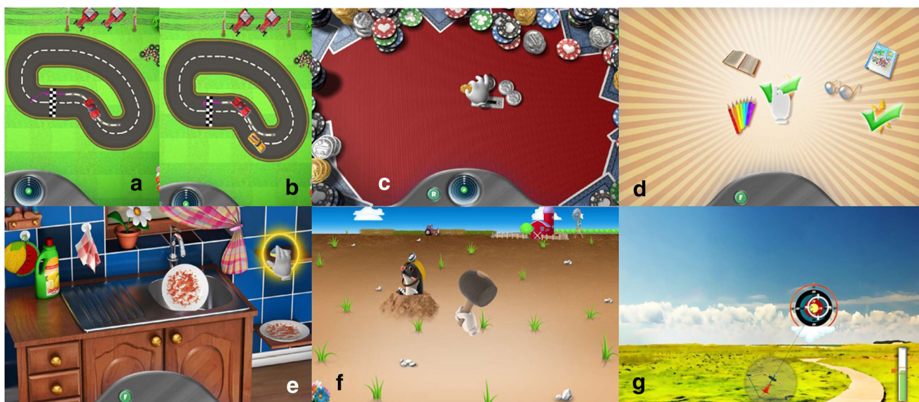
Fig. 2 Robot end-effector protocol. a Trajectories; b pursuit; c coins; d memory; e washing dishes; f moles; g archery

in neurological rehabilitation, on the couch with the patient in a prone or supine position as needed. The protocol also included active movements of the UL against the force of gravity, with the final request of isometric holding of the position for at least 6 s. According to the patient’s resources, the physiotherapist, during the treatment, increased the joint range during passive mobilization and the number of repetitions, starting from a minimum of 5 repetitions up to 15 repetitions at least twice, with a rest break from 2 to 3 min. The stretching exercises were performed statically for at least three times during the session.