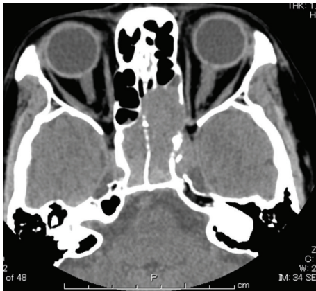
FIGURE 2: CT findings. In both the left and right sphenoid sinuses, soft tissue shadows accompanying skull base damage are apparent.

desire active treatment such as chemotherapy, only palliative care was provided, and she died 3 months later.