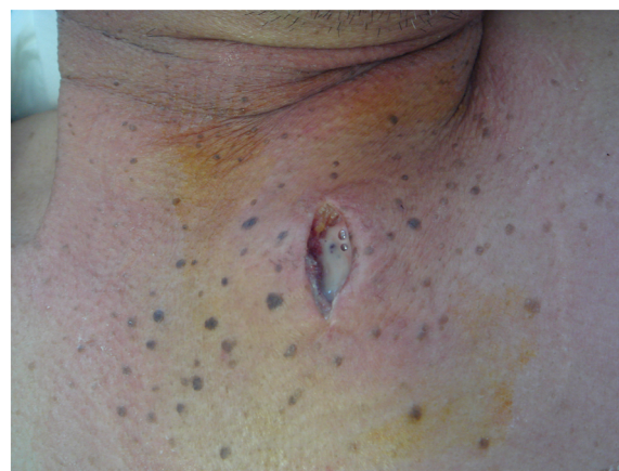
Figure 3 The left SCJ. Aspiration of the SCJ and culture of the obtained fluid yielded a growth of S. aureus .

The patient's general condition improved significantly and his fever subsided after 4 days. The wound at the SCJ was irrigated daily. Twelve days after the onset of treatment, his plasma WBC was 7,050/mm 3 with 78%