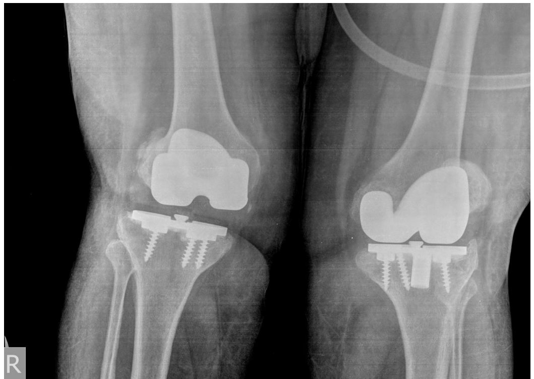
FIGURE 1: Preoperative anteroposterior (AP) standing radiograph showing bilateral failed total knee arthroplasties (TKAs).

leucocyte counts, C-reactive protein, and erythrocyte sedimentation rate (ESR) were within normal limits. A three-phase bone scan was also found to be negative for infection.