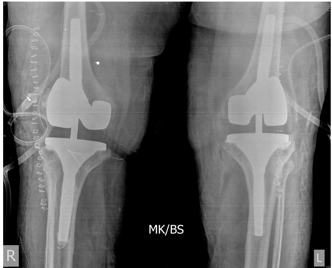
FIGURE 5: Postoperative AP radiographs after bilateral revision total knee arthroplasties showing well aligned new constrained implants in both knees.

The postoperative radiographs showed satisfactory implant positions (Figures 5-6). The patient had no complaints and was able to flex the knee to 80° easily. The range of motion and quadriceps strengthening exercises continued without forced flexion. She gradually resumed full weight-bearing with the help of the walker. Three months after surgery, the brace was removed, and active pain-free range of motion of 0°–115° was achieved with complete stability. At four months, the patient had returned to full activity without the brace or cane. At the final follow-up of four years, the knee was fully stable, and the patient was pain-free with no loosening or wear of the implants.