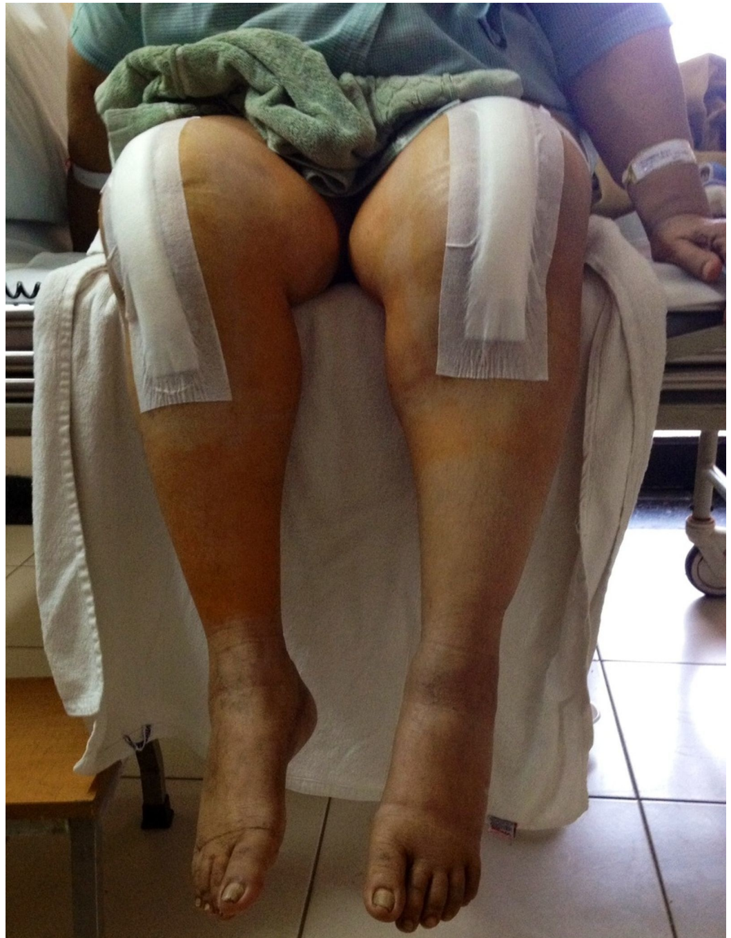
FIGURE 4: Pain-free range of knee motion (0-90 degrees) after bilateral revision total knee arthroplasties in immediate

The knees were protected in hinged braces postoperatively. The drains were removed 48 hours postoperatively; continuous passive motion (CPM) and active knee flexion exercises were started on postoperative day one and gradually increased to 0°–90° of flexion (Figure 4).