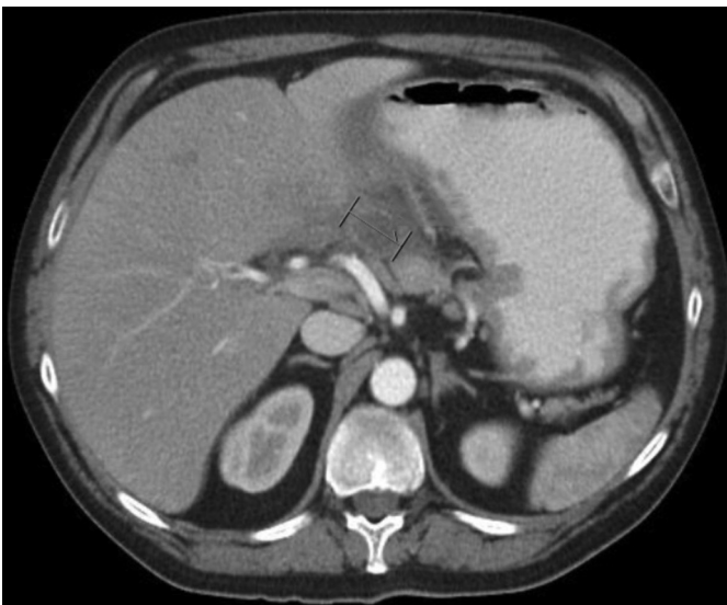
Figure 2. A 3.1-cm intramural low-density area with peripheral enhancement involving the antrum and pyloric area concerning for abscess.

Gastric biopsies showed active gastritis and chemical gastropathy, but no Helicobacter pylori . The excised polyp proved to be a gastric carcinoid tumor with clear margins. Subsequent gastrin and chromogranin A levels were normal, suggesting a type 3 gastric carcinoid tumor. An octreotide scan was found to be normal. The patient had worsening symptoms over the next 2 weeks and presented to the emergency department. Lipase was elevated at 514 U/L, and repeat abdominal CT scan showed a new, intramural low-density area (3.1 cm) with peripheral enhancement involving the antrum and pyloric area concerning for abscess (Figure 2), thrombosis in the middle hepatic vein, and enlarged lymph nodes at the gastrohepatic ligament and near the caudate lobe of the liver. The pancreas was unremarkable. CT-guided needle aspiration