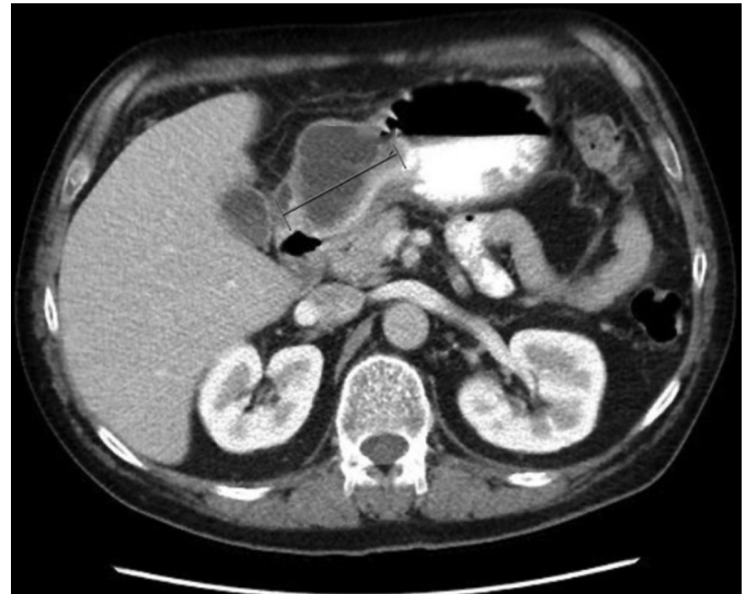
Figure 3. Persistent loculated abscess in the anterior wall of the gastric antrum measuring approximately 4.8 × 6.3 × 5.0 cm.

removed 15 mL of purulent fluid from the gastric wall abscess, and cultures grew Streptococcus mitis and Veillonella (both predominantly oral and airway flora). The patient was started on intravenous (IV) antibiotics and therapeutic anticoagulation, and he showed slow progressive improvement.