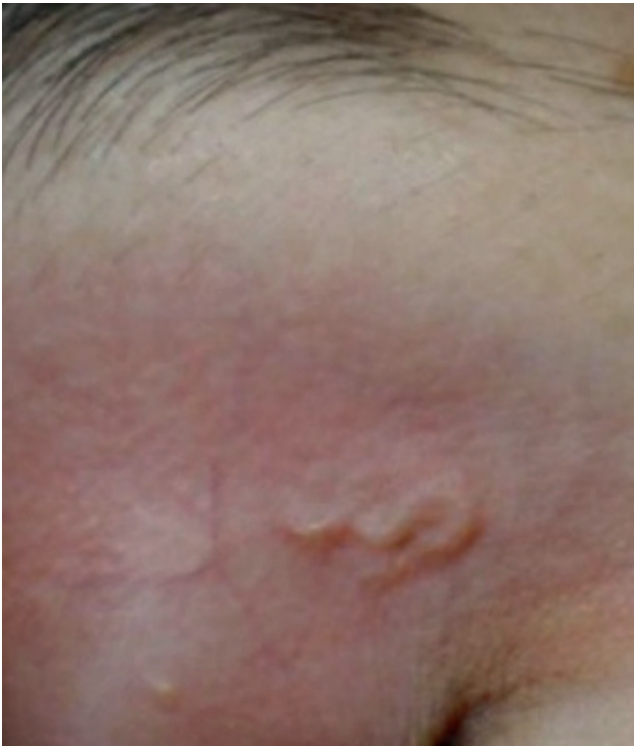
Fig. 1. Subcutaneous localization of Dirofilaria repens in an eyelid.

Only in ocular dirofilariasis, the larva remains intact subconjunctivally, does not calcify, and is usually easily noticed. Numerous subcutaneous and organ localizations have been described in the literature - lungs, oral cavity, reproductive organs, lymph nodes. In most of the cases described by us localization was subcutaneous - 11 (61.1 %), in 9 of these 11 cases, the larva was localized in the upper part of the body - subcutaneous tissue of the upper limb, face, eyelid (Fig. 1). Next was subconjunctival localization - in 4 (22.2 %) cases. In two of these cases, the larva was freely moving. The onset in all four patients manifested with blurred vision of the affected eye, photophobia, irritation, conjunctival injection and tearing. In one patient, the localization was in the oral cavity, and the larva located buccally was extirpated alive (Fig. 2a, b, c). We also described one case of lymph node localization and one case of epididymal localization. Besides local swelling and a subcutaneous nodule found upon palpation, in these individual cases, the patients had no symptoms. In one of the patients with subcutaneous localization of the larva in the area of the right mamilla, we observed a transient maculo-papular rash covering the upper half of the trunk, which, in our opinion, can be explained with antigenic irritation by the parasite.