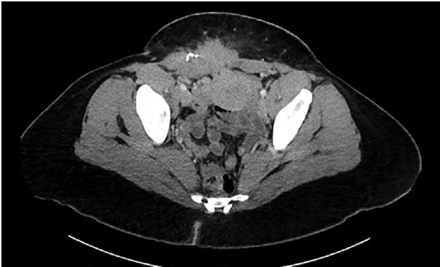
Fig. 1. Computed tomography image showing infiltrating mass within abdominal wall.

The full-thickness composite musculofascial abdominal wall defect measured 23 cm × 10 cm (Fig. 2) with associated bilateral pubic bone exposure after en bloc resection of the endometrioma and concurrent hysterectomy and bilateral salpingo-oophorectomy. Due to the inherent field contamination associated with the concomitant gynecologic procedure and the proximity to bowel, a 20 cm × 20 cm perforated porcine noncrosslinked acellular dermal matrix (ADM) was selected for the repair and placed as a wide intraperitoneal underlay (Fig. 3). The ADM was secured inferiorly with 5 bone anchors and running long-acting resorbable suture. The most superior 8 cm of the resected musculofascia was primarily reapproximated over the ADM using long-acting resorbable sutures in interrupted, figure-of-8 fashion. The final size of the bridged repair was 15 cm × 8 cm. The skin was closed through design of suprafascial bilateral soft tissue advancement flaps with closure in both interrupted and running fashion. The patient received a kenalog 40 µg/mL injection along the incisional dermal margin due to known history of keloid scarring. Finally, the dermis was reapproximated over a 19-French Blake drain and the closed wound was covered with incisional negative-pressure wound therapy set to 125 mm Hg per surgeons' standard practice to decrease perioperative complications related to wound healing.