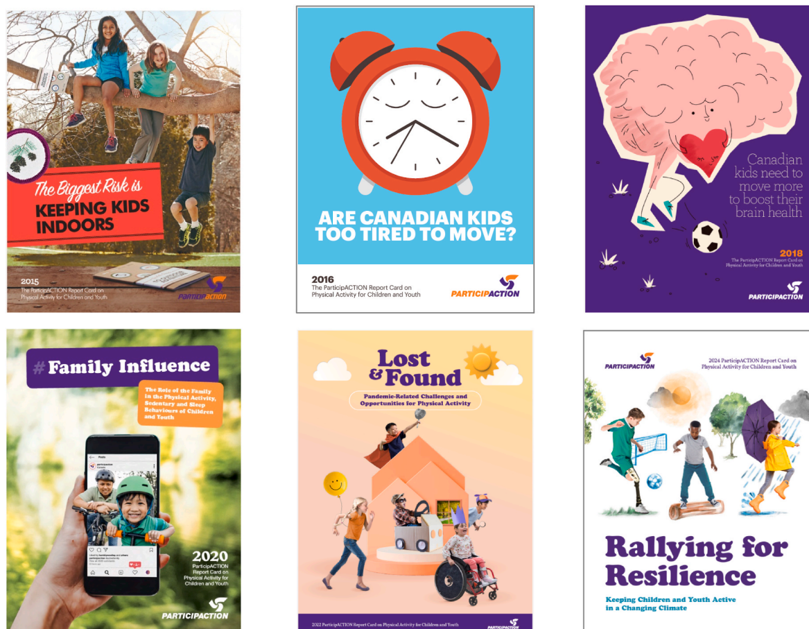
Fig. 1. Cover pages of the Children and Youth Reports Cards (2015–2024).