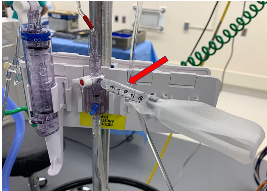
FIGURE 2: Method for eliminating hyper-resonance

undesirable [35]. A method proposed by Gardner [36] to increase the damping coefficient without decreasing the natural frequency is to add a fluid-mechanical stub device containing a sealed air bubble. One of the commercial devices using this principle, the Resonance OverShoot Eliminator (ROSE) device, has been shown to increase the average damping coefficient from 0.2 to 0.8 while not reducing the natural frequency [37]. These devices, however, never were broadly adopted in clinical practice. A simple setup involving a syringe with a small air bubble in communication with the arterial line allows for the dampening of a hyper-resonant system in clinical practice (Figure 2).