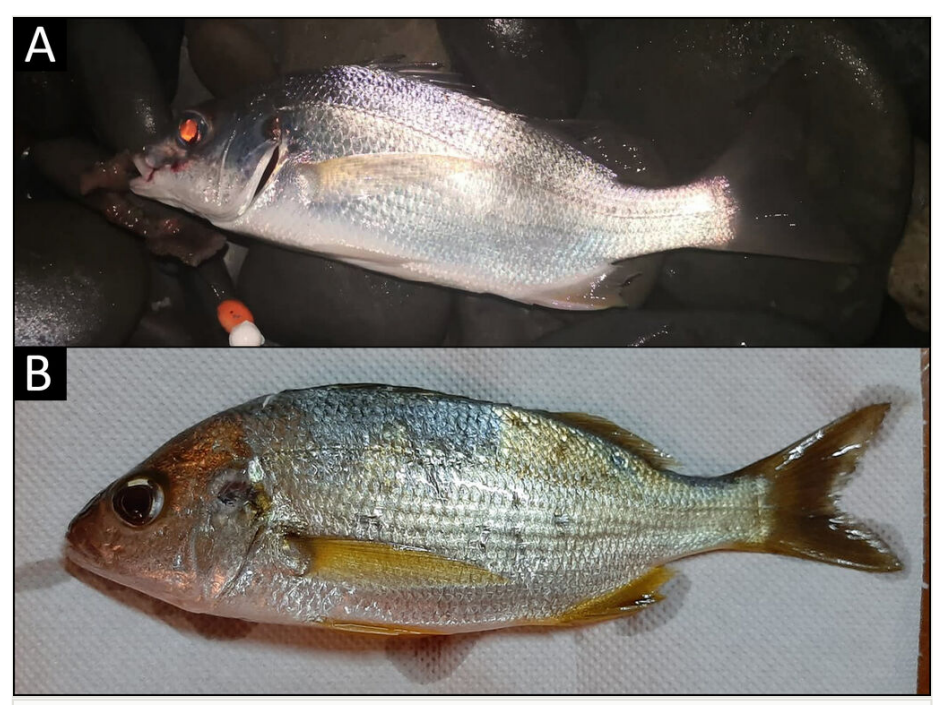
Figure 2. doi Pomadasys incisus from Cyprus. A. A specimen from Morfou Bay, total length around 17 cm (colours altered by the flash. B. A specimen from Limni beach, total length around 13 cm.

recreational fisherman caught one specimen around 13 cm (total length) at Limni Beach ( 35°03'08.2"N, 32°26'36.4"E) on a sandy bottom (Figs 1, 2B). All specimens were caught during night, using a fishing rod from the shore and rag worms (family Nereididae Blainville, 1818) as bait. As the bastard grunt was unknown to them, both fishermen posted the photos of the specimens to the social media platform group mentioned above. Finally, a bibliographic research was carried in order to update and evaluate the distribution of this species in the Mediterranean Sea.