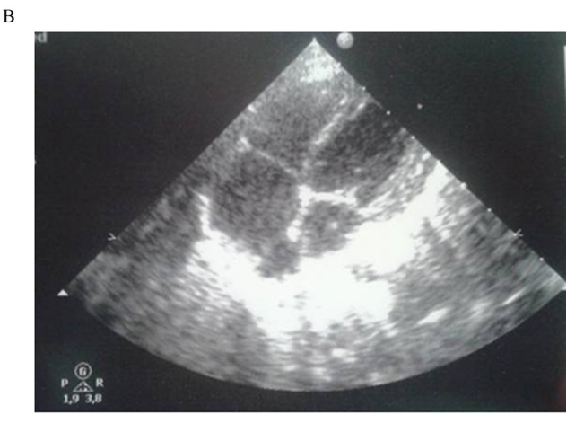
Figure 2 Echocardiogram showing (A) cardiac thrombosis (hyperdense image (30 \, \text{mm} \times 4 \, \text{mm}) with tricuspid valve attached to both the atrial and ventricular faces) and (B) resolution after heparin treatment.

When evaluating eculizumab discontinuation we considered the clinical status of the patient and their individual risk benefit profile (including genetic analysis). The topic of eculizumab discontinuation is important yet without consensus. A recent study stated that it is not yet clear whether patients with or without identified genetic mutations are at higher risk of new TMA manifestations when eculizumab is discontinued. 18 However, another suggests eculizumab discontinuation may be safer in patients with no documented complement gene variants after 6-12 months of treatment. 19 Recommendations on treatment discontinuation may become clearer as this is tested in prospective studies and as evidence accumulates in the literature. At current evidence level the decision of length of eculizumab treatment is taken on a case-by-case basis. The decision on treatment strategy should consider the patient's unique clinical situation, age, TMA and family history, as well as recognition of the complex and unpredictable nature of aHUS. If discontinuation of eculizumab is to be considered, the patient must: have been treated for a sufficiently long period to ensure maximal organ function recovery; be monitored closely for signs and/or symptoms of TMA; and have