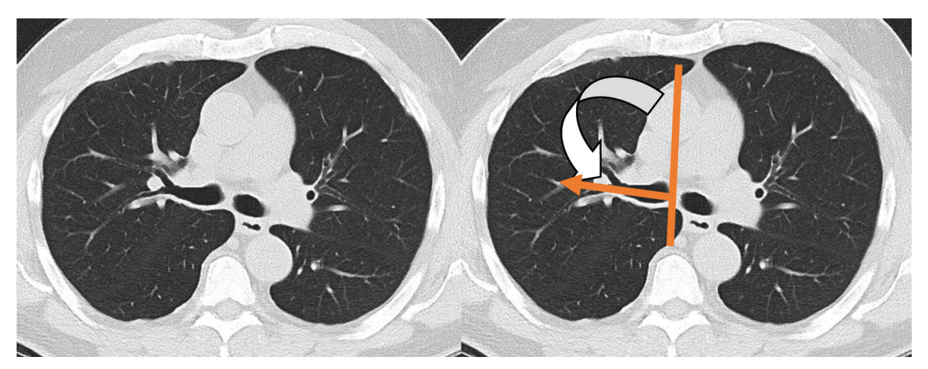
Fig. 1. Normal Right Upper Lobe Bronchial Angle (RUL-BA) measuring 88 degrees

Our initial study population consisted of 640 chest CT scans. 7 of these scans were excluded because the patients' right upper lobe had been resected, 69 were excluded because the radiographic diagnosis was not consistent with patterns of sarcoid