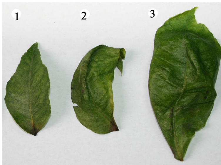
Fig. 1 The symptom of Citrus limon leaves after infection with HSVd. Lanes 1–3 represent the symptom of different leaves from the same Citrus limon tree

Previous studies have indicated that the 5' terminal nucleotides of siRNAs have a pivotal role in directing the siRNAs to specific AGO complexes [11]. In contrast with the observations for diverse plant virus-specific small RNAs, which display a clear tendency to begin with Uracil (U) or Adenine (A) [12, 13], HSVd-siRNAs with a Guanine (G) at their 5'-end are the most abundant, and account for about 30.06 %, those with A,