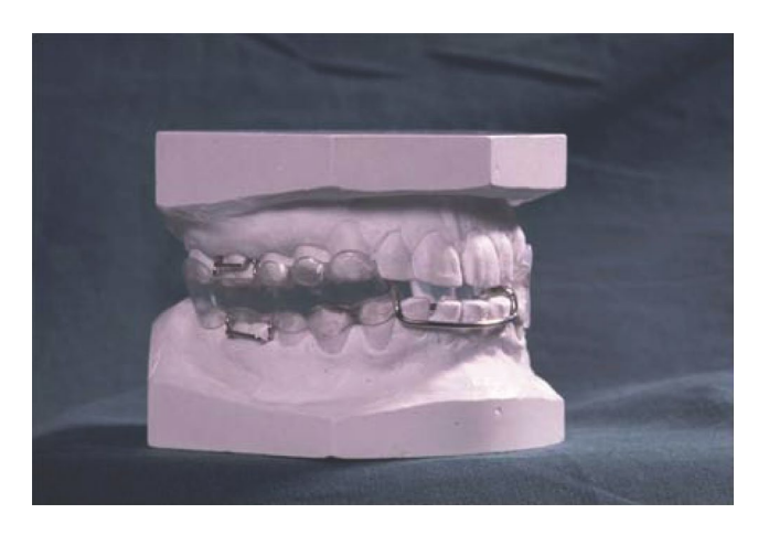
FIGURE 2 Illustration of the oral appliance with monobloc design used in the study

Ambulatory somnographic recordings were made with a portable digital recording unit with sensors for the registration of airflow,