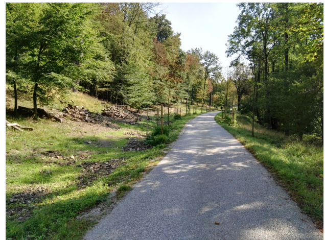
FIGURE 3 Going on a hike with the family as an example of shared activities

If present, healthy siblings were also described as confidants and sources of support, with whom caring responsibilities could be shared. In the words of one young carer: "They [referring to healthy siblings] just understand you best and they help you to shoulder the