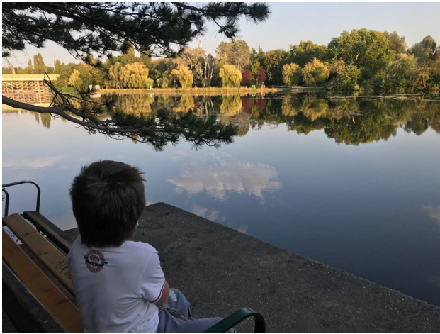
FIGURE 4 Finding, sharing, and enjoying common interests and activities with the ill/disabled family member