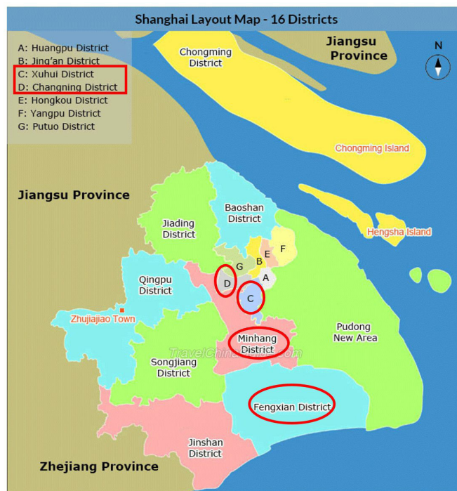
Figure 1 Map of the four Shanghai districts collaborating in the Sino-Canadian Healthy Life Trajectories Initiative trial. 25

A flowchart of the study design is shown in figure 2 . MCHUs and their catchment areas were stratified by district (N=4) and randomly allocated to intervention and standard care groups with a ratio of 1:1 within each district. MCHUs were randomised as the intervention required training of HCPs in the MCHUs to develop their skills and practice in childhood OWO prevention strategies. We assumed HCPs who had received the training required to provide the trial intervention to study participants might modify their approach to the clinical care provided to all children receiving care in the unit. The cluster randomisation design was chosen to minimise contamination of control subjects. Usual care was selected for control group MCHUs since the research question is to determine whether the CFMC intervention is superior to the current practice. Participants in both the intervention and control groups will have the same access to the current healthcare resources, while participants in the intervention group will receive additional CFMC interventions provided by SCHeLTI.