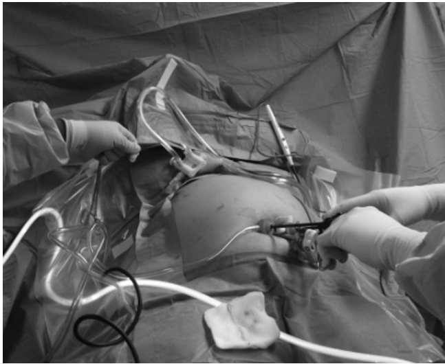
Figure 1. Position of second assistant retracting gallbladder with Prolene stitch (left) and surgeon maneuvering instruments in parallel position (right).

placed intra-abdominally. The gallbladder is dropped into the bag and extracted from the abdomen. The fascial opening is closed with No. 0 Vicryl sutures (Ethicon Endo-Surgery). The umbilicus is reattached to the fascia with No. 3–0 Monocryl (Ethicon Endo-Surgery), and the skin is closed. The wound is dressed with Dermabond Advanced Topical Skin Adhesive (Ethicon Endo-Surgery).