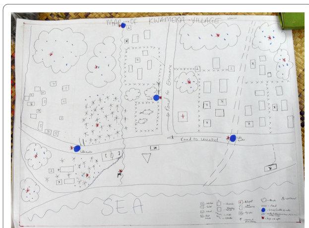
Figure 1 Map drawn by South Tanna women of malaria risk factors in their village.

In such contexts, health education initiatives that attempt to elicit participation only through increasing malaria knowledge and by encouraging individuals to take responsibility for their own health will be ultimately ineffective [19,20]. Mobilising or augmenting social capital has been identified as an important prerequisite to enhancing health promoting behaviours and will be more effective than an approach that emphasizes individual rational choice [10]. Social capital, described as an overarching concept that pulls together previously described phenomena such as 'sense of community,' 'community competence,' 'collective efficacy,' 'critical consciousness,' and 'empowerment,' is thought to be critical for achieving and sustaining community participation in health programmes [10,21]. In Tanna, where existing social mechanisms appear to promote a strong 'sense of community,' and influence individual and household level decision making, complementary strategies should be employed that concurrently augment social capital, improve individual knowledge regarding malaria and its transmission and dispel rumours and misconceptions that can create community resistance to participation in malaria prevention practices. A multi-faceted, multi-level approach will