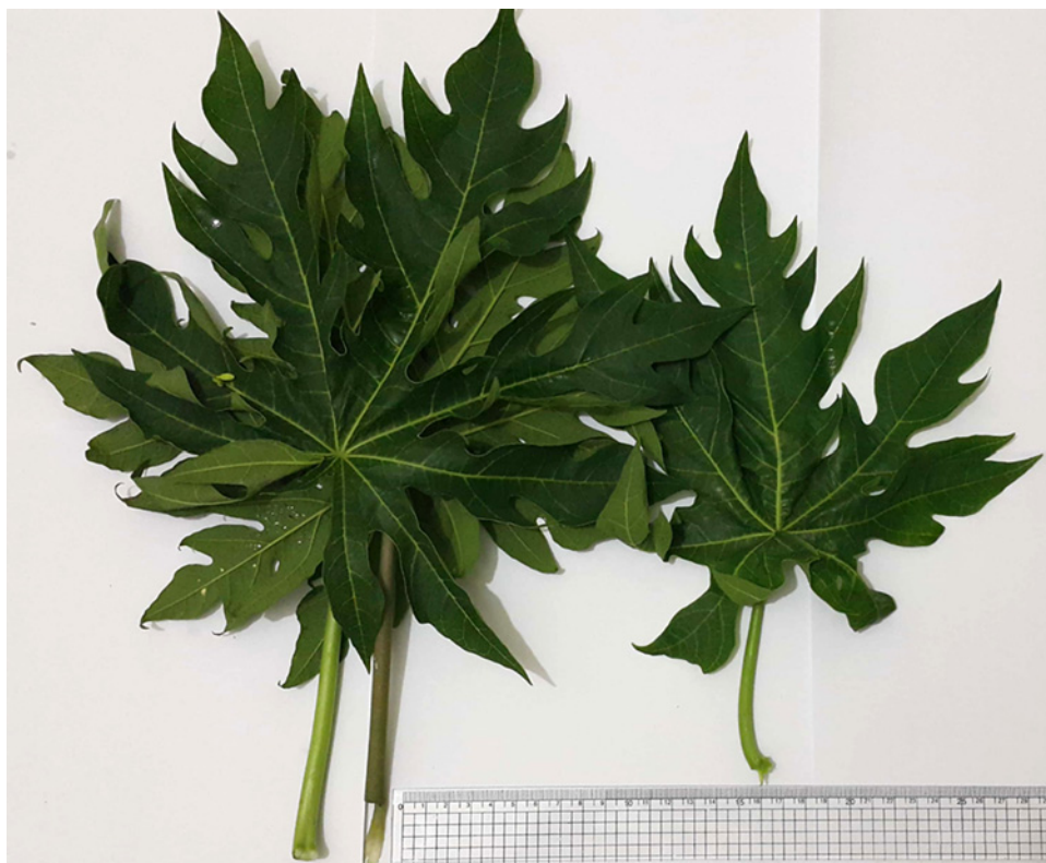
Figure 1. Carica papaya leaves used for extract preparation

higher (most common) levels of iron stores (ferritin) in the body. Hepcidin (a peptide hormone synthesized in hepatocytes that is a key regulator of iron levels) decreases the efflux of recycled iron from splenic and hepatic macrophages, and the release of iron from storage in hepatocytes leading to functional iron deficiency. Moreover, it binds to enterocytes causing poor absorption of dietary iron. Inflammation (including kidney injury) increases hepcidin concentration, along with other inflammatory mediators as C-reactive protein and Interleukin-6, which results in lower levels of circulating iron and development of anemia [6].