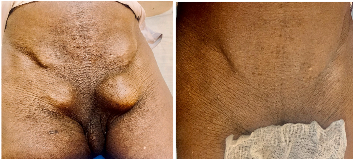
Fig. 1. Clinical photograph showing preoperative bilateral inguinal and femoral hernias.