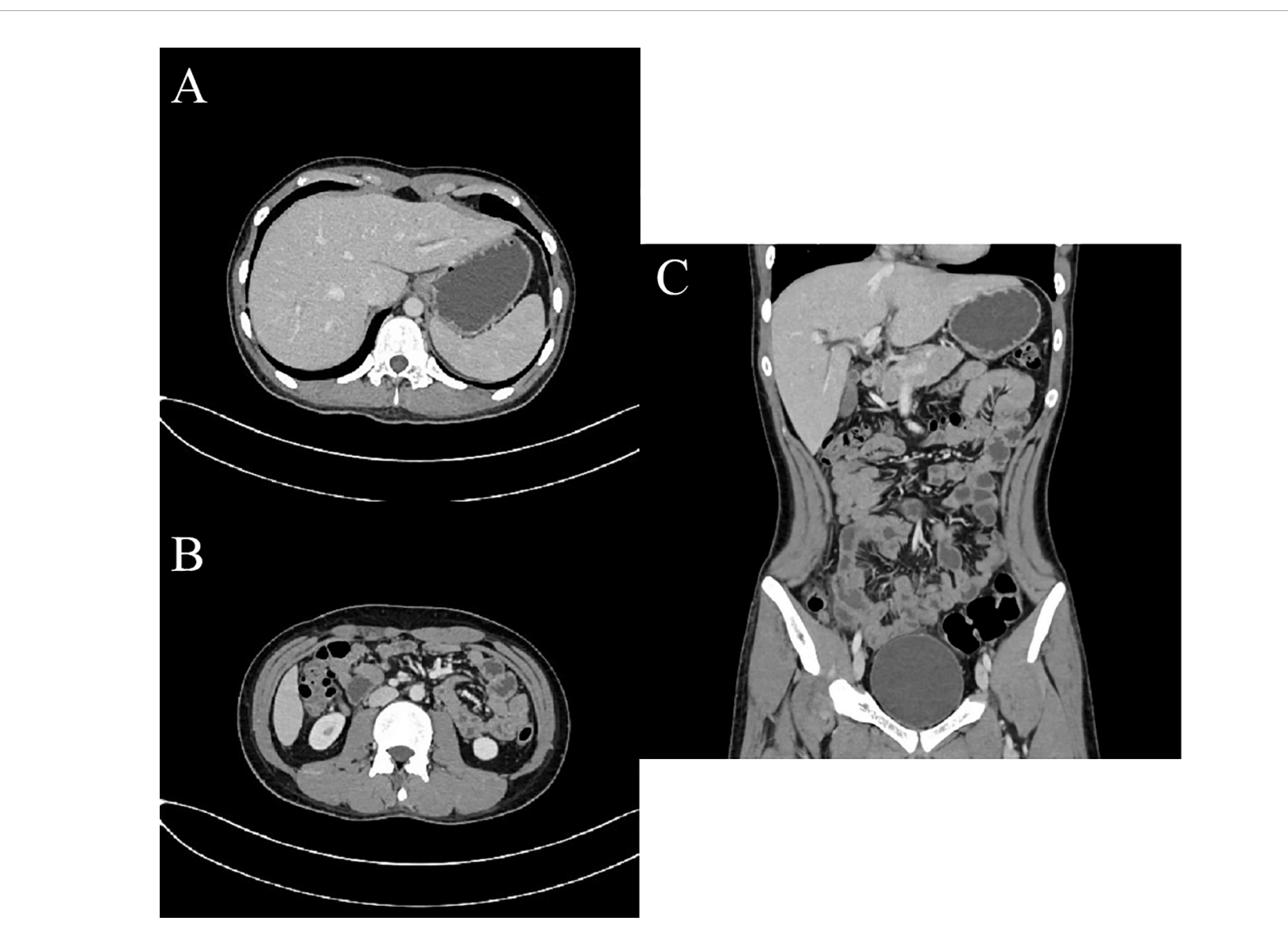
FIGURE 3 | CT examination post-treatment. Axial (A), Axial (B), and coronal (C) enhanced CT images of the abdomen and pelvis in the portal phase post-treatment demonstrated resolution of ascites, thickening of peritoneum and omentum disappeared and turned to the normal shape.