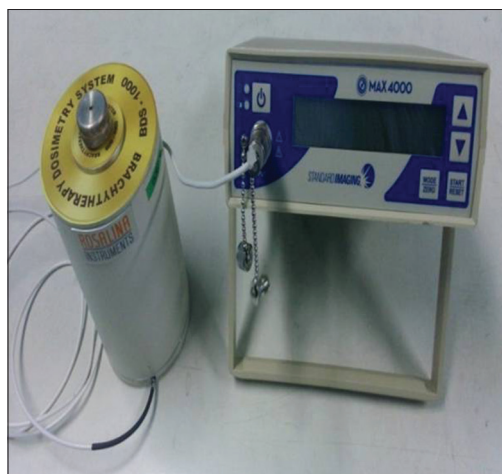
Figure 1: BDS 1000 well-type ionization chamber with the standard imaging MAX 4000 electrometer

HDR: High-dose rate, LDR: Low-dose rate, TNC: Threaded Neill–Concelman