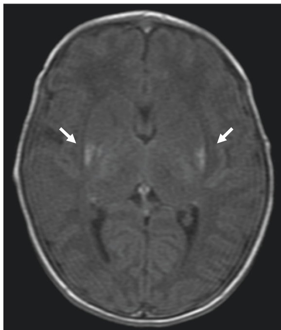
Figure 2 Brain head magnetic resonance reveals bilateral small hyperintensities on T 1 -weighted images in the basal ganglia: bilateral putamen, pallidum and thalamus (white arrow).

of antipsychotic drugs and/or by eclampsia. In Japan, the prevalence of schizophrenia was relatively high and the number of schizophrenics was increasing [11]. We speculate that the number of Japanese pregnant woman with schizophrenia will also increase in Japan in the future. We conclude that medical staff must be aware of the possibility of non-specific symptoms including cardiopulmonary arrest in pregnant women with schizophrenia.