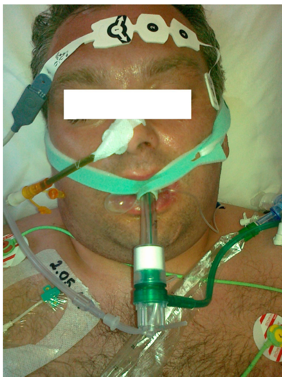
Figure 2 Presentation of Boussignac CPAP (Vygon, Ecoen, France) system during apneic test.

ventilation protocol with high PEEP value (at least 15 cm H 2 O) to avoid quick atelectasis formation. Thus, lack of PEEP during classical performance of apneic test led to quick desaturation and rapid hemodynamic deterioration, limiting the observation period to less than the minimum 10-minute interval. Apneic tests with the Boussignac CPAP system showed lack of any observed or monitored spontaneous respiratory effort or activity. Laboratory gas analysis results were: first test (typical apneic test with oxygen insufflation only): pH 7.361/7.157; PaCO 2 52.9/93.8 mmHg; PaO 2 72.3/52.5 mmHg; SaO 2 94.7/78.6%; second test (with Boussignac system): pH 7.338/7.11; PaCO 2 56.8/108 mmHg; PaO 2 118/78.1 mmHg; SaO 2 98.2/91.1%. These data completed the diagnostic protocol confirming the patient's brain death status.