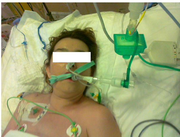
Figure 5 Patient during second series of apneic test using Boussignac CPAP system (Vygon, Ecouen, France).

other countries introduced this test into the law regulated diagnostic protocol for brain death confirmation. In case of unstable patients with severe respiratory disturbances very rarely is there a possibility for successful procedure with the use of oxygen catheter alone, because of deep desaturation and hemodynamic destabilization occurrence. Many different techniques were proposed for such a situation to stabilize FRC and gas exchange. 9–11 The advantages of Boussignac