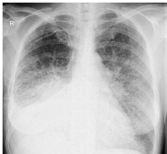
Figure 3 X-ray of chest of second patient – ARDS after lung embolism complicated by lung infection.

A 39-year old woman was admitted to internal ward because of severe respiratory distress. She complained of breathing difficulty for 2 days, which deteriorated and while presenting to the emergency department she was getting tired quickly and required oxygen supply to maintain SpO 2 >90%. Chest X-rays revealed lung embolism complicated by lung infection (Figure 3). After thrombosis therapy and antibiotics her state