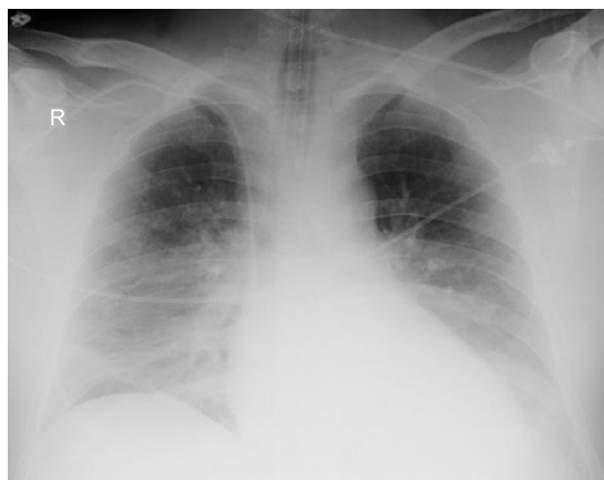
Figure 1 X-ray of chest of first case – ARDS following massive gastric content aspiration.

The 36-year old patient was admitted to the intensive care unit (ICU) because of respiratory insufficiency during severe intracranial hemorrhage. He initially presented signs of acute lung injury, probably because of previous gastric content aspiration during initial period of neurological deterioration, evolving into full scale adult respiratory distress syndrome (ARDS) (Figure 1). After patient stabilization with the use of ventilation therapy and catecholamine infusions we observed progressive deterioration of central nervous system functions, including deep unconsciousness and loss of all brainstem functions, indicating possible brain death.