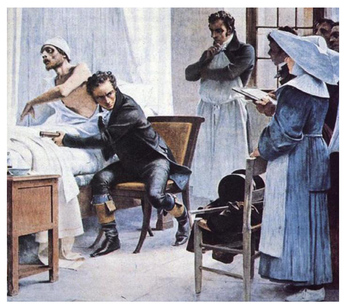
Figure 2 Laënnec at the bedside performing direct auscultation. Notes: Image from the U.S. National Library of Medicine. Painting by Théobald Chartran (1849–1907).

200 years of clinical use, the classic stethoscope would become obsolete and replaced by new electronic systems.<sup>16</sup>