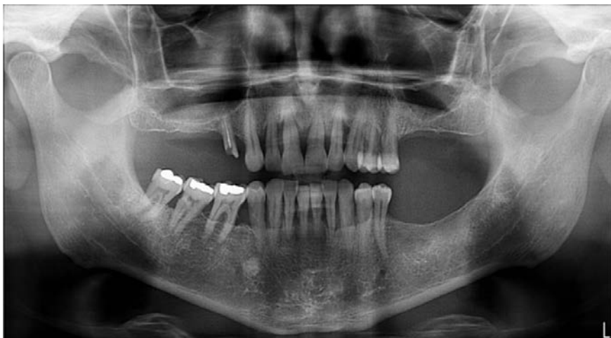
Figure 1. A 50-year-old man panoramic radiograph showing multiple edentulous upper and lower sites with advanced periodontal disease.

niques generally used by the dental practitioner. Nowadays, with the technological enhancement of the imaging techniques used in dentistry like CBCT, more details and better evaluation are provided and consequently, these uncommon impacted structures could be noticed.