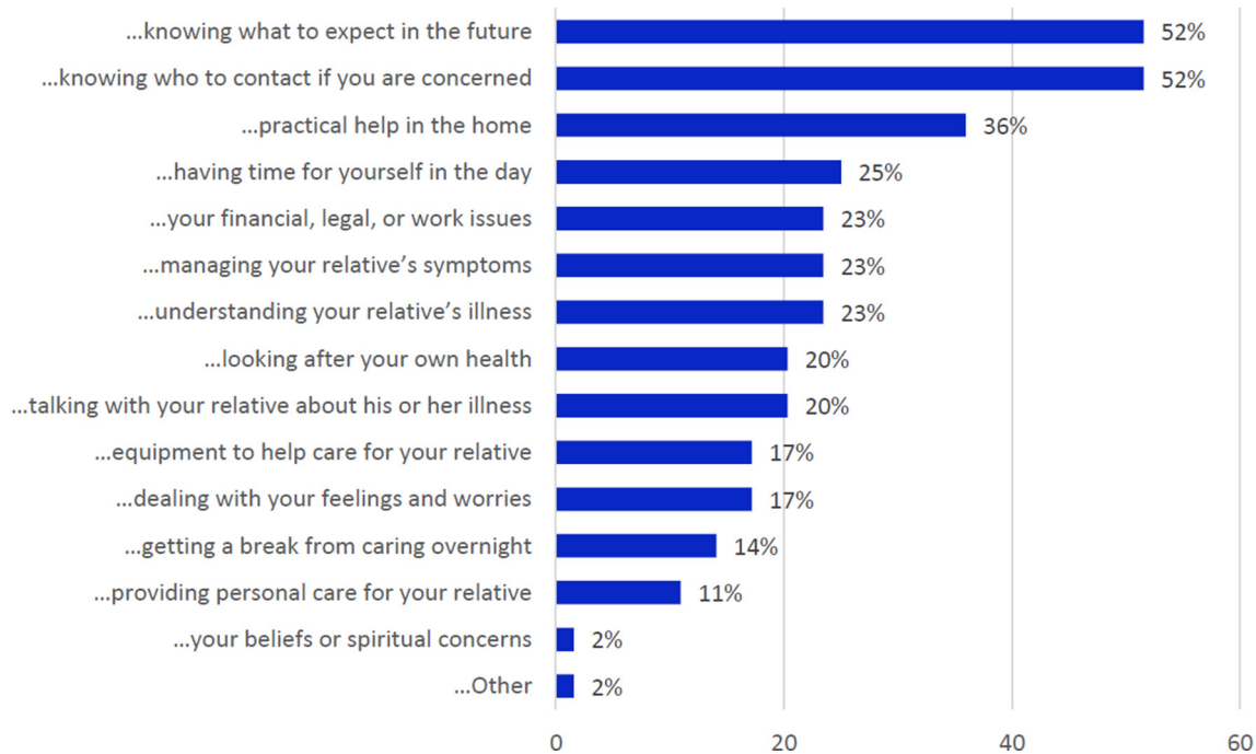
Figure 2 Percentage of family caregivers expressing need for more support within each Carer Support Needs Assessment Tool domain.

as opposed to the enabling needs to help them to care, featured in the top support needs, namely practical help in the home, having time for themselves in the day and financial, legal and work issues.