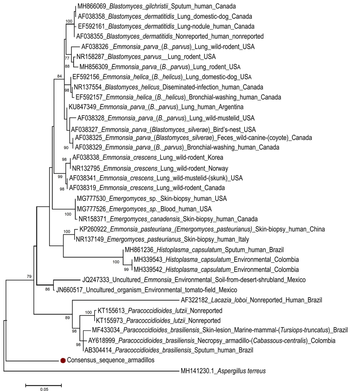
Figure 3. Maximum likelihood phylogram with 1000 bootstrap replicates of the alignment of the consensus internal transcriber spacer (ITS) 1, 5.8S rRNA gene and ITS 2 nucleotide sequence obtained in two six-banded armadillos ( Euphractus sexcinctus ) from this study, 35 selected fungi of the order Onygenales and Aspergillus terreus (MH141230) as outgroup.

Ethical standards. This study was carried out in compliance with the System Authorization and Information on Biodiversity (SISBIO) of the Brazilian Institute of Environment and Renewable Natural Resources (IBAMA) (license number: 58745) and was approved by the Ethics Committee on Animal Use (CEUA) of the School of Veterinary Medicine and Animal Science—University of São Paulo (FMVZ-USP) (protocol number: 7198020317). All animals were dead at the time of necropsy; no animals were euthanized in this study.