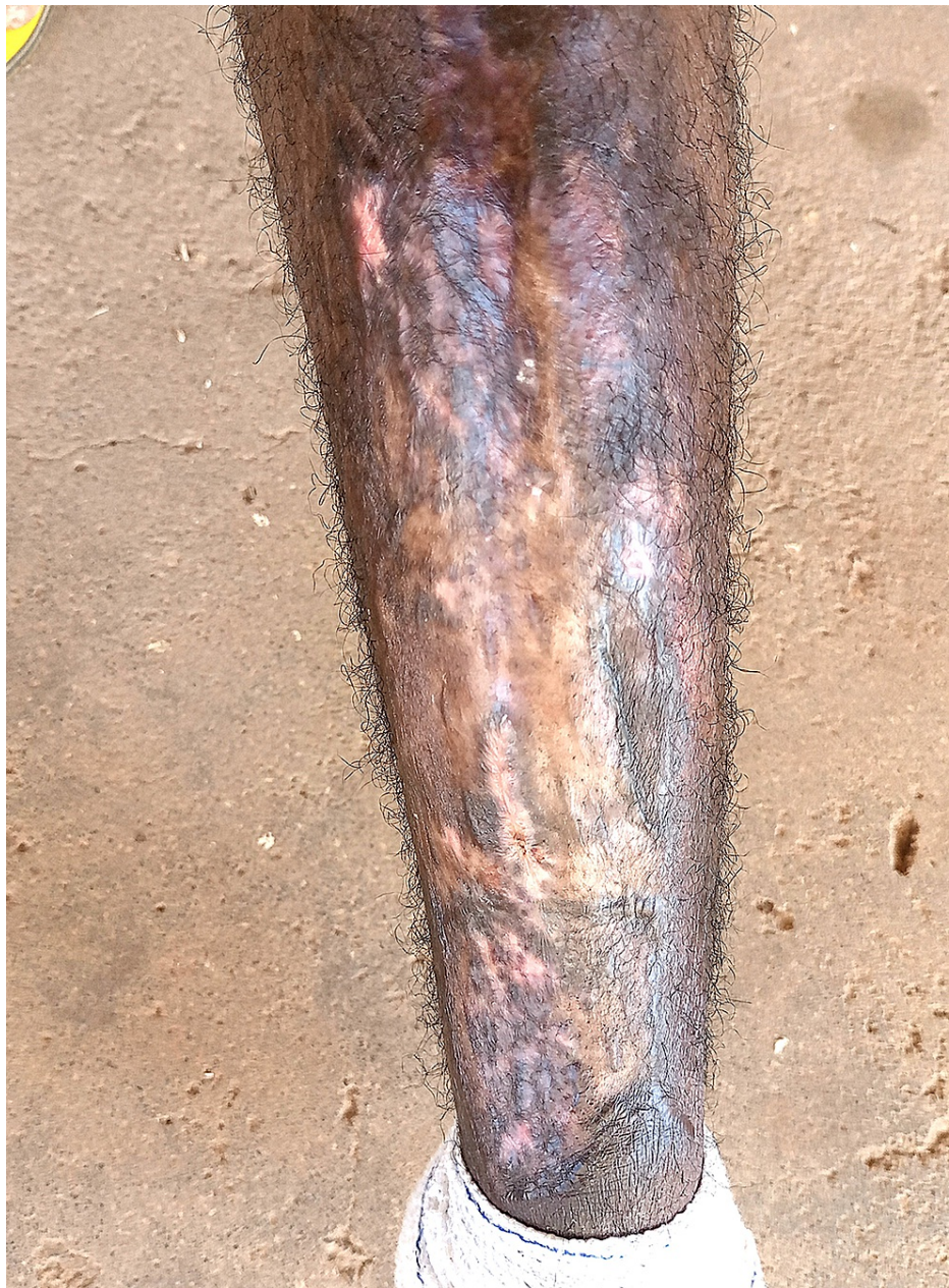
FIGURE 4: Graft site at two-week follow-up visit showing near-complete healing