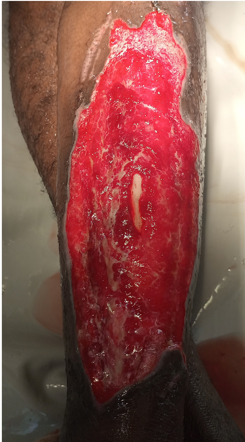
FIGURE 1: Extensive tissue invasion seen after irrigation and debridement of leg ulcer

On the sixth day of admission, the leg ulcer was irrigated with copious amounts of warm saline followed by debridement (Figure 1). Autogenous split-thickness skin grafting was performed the next day (Figure 2) while awaiting the culture results.