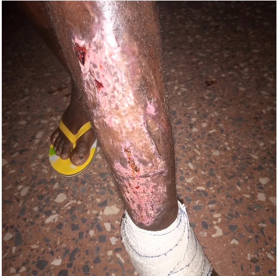
FIGURE 3: Good healing of graft site