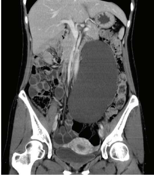
FIGURE 1: Coronal section of abdominal CT demonstrating a large water density occupying much of the left retroperitoneal space.