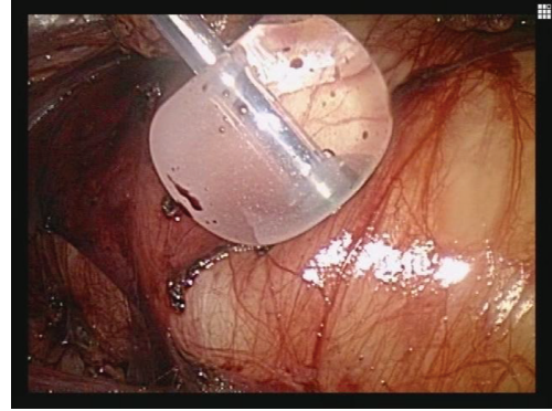
FIGURE 3: Laparoscopic view showed a wall of the retroperitoneal lymphangioma. Only the inflated proximal balloon is visible.

carefully using a SAND balloon catheter to reduce the size without spilling of the tumor content under laparoscope. About 1 litre of fluid was removed from the cyst. During the maneuvers of mobilization and as a consequence of the fragile wall, the cystic tumor was opened and the fluid was suctioned. The tumor pedicle is coagulated and cut by LigaSure V (Tyco Healthcare Japan, Tokyo, Japan). The excised tumor was put into an Endopouch retriever and removed from the body. The cyst could be completely removed. And its wall was thin without any solid elements. Analysis of the fluid revealed lymph. Cytology showed no malignant cells. Surgical duration was 290 minutes and the estimated blood loss was less than 10 mL. Histological examination confirmed the preoperative clinical and radiological diagnosis. A physical examination revealed complete resolution of the abdominal swelling and the hydronephrosis