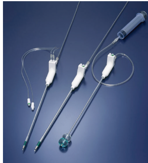
FIGURE 4: Structure of the SAND balloon catheter.

resolved after the operation. No recurrence has been noted on radiographic imaging 16 months postoperatively.