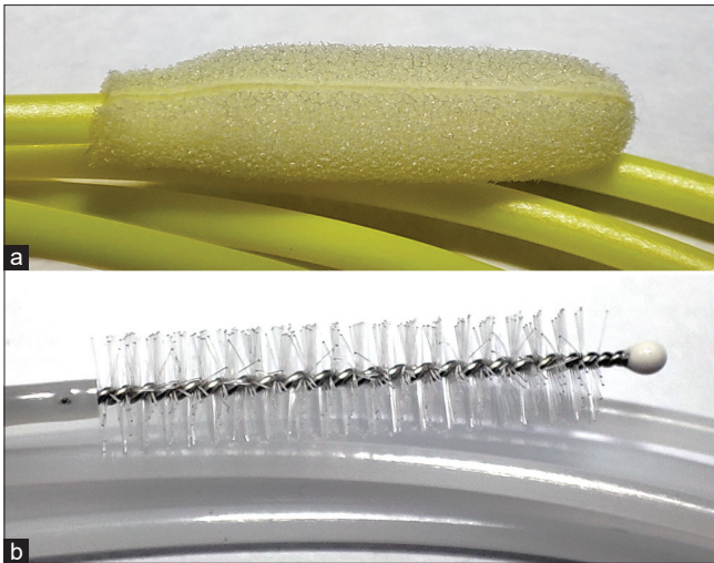
Figure 1: Photos of sampling brushes (a): PU brush (b): PA brush

Since 2016, we have used the observational research method for many years in Tianjin, the largest coastal city in northern China, comparing the microbial recovery effects of different sampling techniques (CFSM, FBFSM, and PASM). However, the small sample size collected each year and the significant differences in the endoscopes' background characteristics may lead to a particular selection bias and insufficient evidence for the sampling techniques' estimated effects. Although our previous research reported that FBFSM or PASM had been associated with the impact of endoscope microbial recovery, [1,27] it remains unclear if associations were attributable to selection bias.