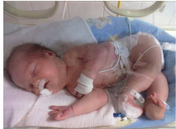
Figure 2 The third day of life - the whole figure - noticeable free thumbs and apparent dislocation on the left knee-joint.

tone, especially in the head - shoulder line and weakened tendon reflexes. He stayed in a constrained position on the side.