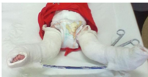
Figure 5 Manipulative casts – Improvement of knee flexion with bar improving external rotation in the hip joints, the first attempt to correct the foot by Ponseti – age 20 weeks.

At the moment it is not possible to determine what level of motor and intellectual development the described child can reach [9]. Parallel occurrence of arthrogryposis, micrognathia, retrognathia, and the consequences of perinatal hypoxia make the prognosis difficult and uncertain. Intensive rehabilitation started early, supported by daily supervised exercises conducted by the parents gives the child with arthrogryposis an opportunity to improve the range of motion in the joints and to reduce the need for subsequent radical invasive corrections [10]. Treatment of clubfoot in arthrogryposis with Ponseti's method is believed by many researchers to be an effective method helping to