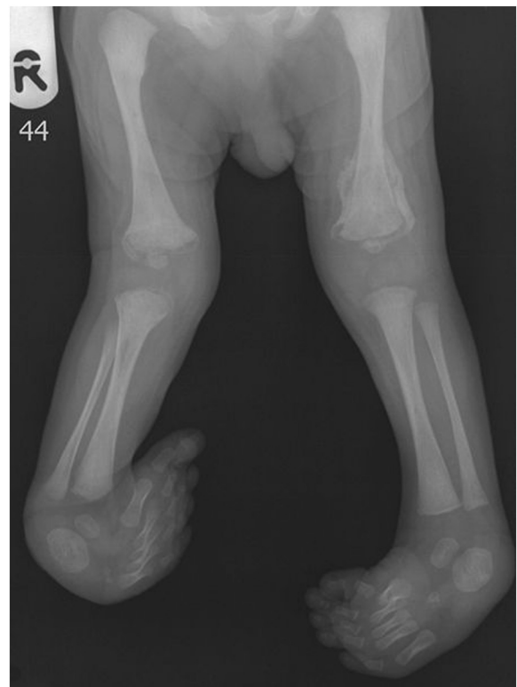
Figure 3 X-rays of the lower limbs taken at the age of 10 days.

An x-ray image of the lower limbs showed visible callus around the femur fractures, the occurrence of perinatal fracture and deformation typical for a clubfeet (Figure 3). An ultrasound examination of the hip and knee joints revealed the following: legs positioned in an