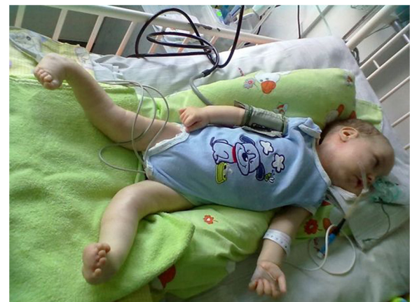
Figure 6 The improvement in the external rotation of the hip joints – age 20 weeks.