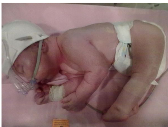
Figure 1 The first day of life.

Examination after birth revealed the presence of micrognathia, retrognathia and contractures of the joints typical for AMC: i.e. affecting the wrists, elbows and shoulders as well as legs in the form of clubfeet - scoring 4 on Dimeglio scale, accompanied by knee-joint subluxation and dislocation of the right hip joint (Figures 1 and 2). The baby presented no sucking reflex, a very weak reactivity to external stimuli, reduced muscle